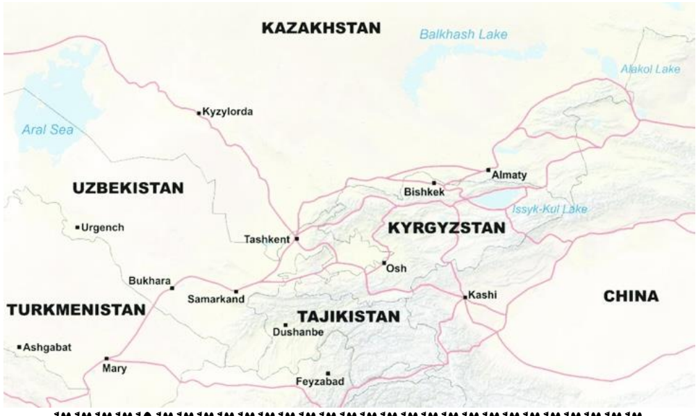
*** *** *** *** *** *** *** *** *** *** *** *** *** *** *** *** *** *** *** *** *** *** *** *** *** *** *** ***

Jane gave her talk on her journey to Central Asia, where she had explored some of the ancient lands and medieval cities of the fabled Silk Road. Through her slides, she shared with us the incredible diversity, both scenic and cultural, experiencing incredible history.